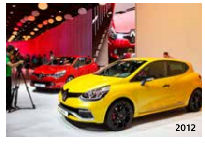
2012 The new Clio Renault Sport 200 EDC made its world debut at the 2012 Paris Motor Show, marking a return to turbocharging as well as showcasing its five-door only bodyshell. Notably, it was the first Renault Sport model to use an EDC dual-clutch transmission, offering automatic or manual – with paddle shift controls – gear selection.