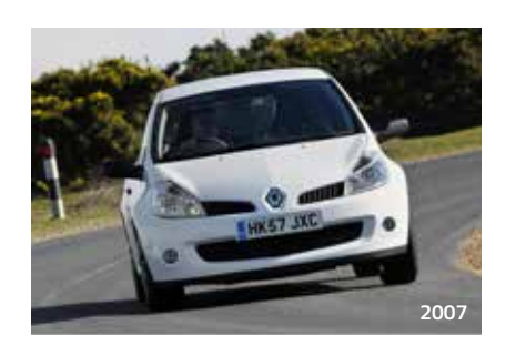
The limited-edition Clio Renault Sport 197 F1 Team was launched, featuring a new, more focused Cup chassis. Its settings became standard on the Clio Renault Sport 197 Cup, launched later that year, which came with an unbeatable price-to-performance ratio.