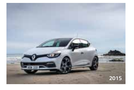
2015 Introduction of the Clio Renault Sport 220 Trophy, a car unashamedly targeted at track-day enthusiasts. With a 10 per cent increase in power to 220hp, the availability of up to 280Nm of torque using the Torque Boost function in fourth and fifth gears, a comprehensively lowered and stiffened chassis with even more rapid EDC gearshifts and steering, and bespoke Michelin Pilot Super Sport 205/40R18 tyres, it resurrected the concept of the ultimate Renault performance hot hatch, continuing the company's rich heritage in this area.