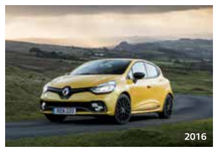
In June, the Clio Renault Sport offering became even more impressive, the line-up benefitting from the advances in the New Clio range, which has resulted in the latest Clio Renault Sport models becoming the most advanced yet.