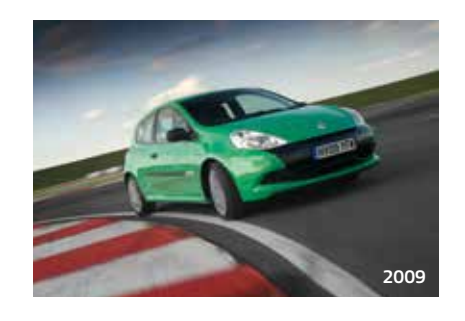
May 2009 saw the introduction of the Clio Renault Sport 200 Cup and Clio Renault Sport 200, featuring a new design and engine and suspension enhancements.