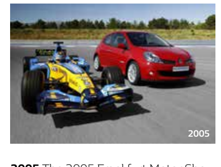
The 2005 Frankfurt Motor Show saw the unveiling of the Clio III Renault Sport Concept with the production version, the Clio Renault Sport 197, making its world debut at the Geneva Salon the following March.