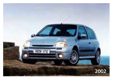
A limited edition 172 Cup, based on the Clio Renault Sport 172 of the previous year, added to the store of legendary Renault hot hatches, lighter and stiffer than its predecessor.