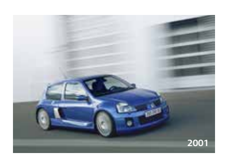
2001 Around the same time as the Clio Renault Sport 172 appeared in 2001 there was also a re-birth of the 5 Turbo mid-engined hot hatch format. This was the outrageously styled 230hp 3.0 V6 Clio, fitted with only two front seats. A second-generation model followed, developing 255hp accompanied by an intoxicating soundtrack, a revised supercarshaming body and a 0-62mph acceleration time of just 5.8 seconds.